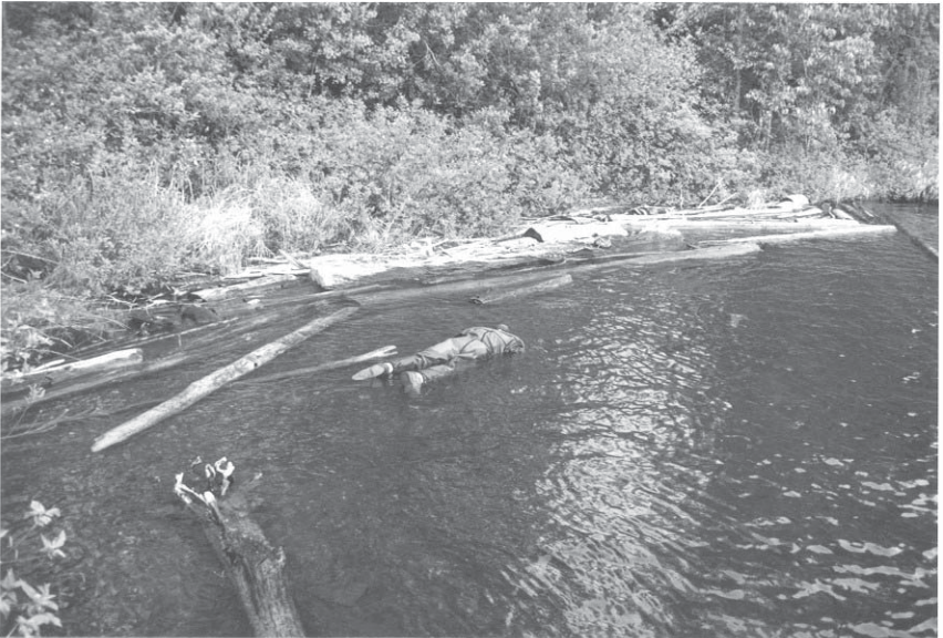
Scientist Roger Tabor of the U.S. Fish and Wildlife Service surveys the Lake Washington shoreline looking for juvenile chinook salmon. The City of Seattle has contracted with key scientists to conduct research on the habitat preferences of juvenile chinook salmon in Lake Washington.

The formation of shallow littoral habitat along the shores of Lake Washington is dependent upon three major physical processes: 1) sediment production; 2) mobilization of lake sediments; and 3) sediment deposition along the shore of the lake. The most important sediment sources to Lake Washington are bank erosion (including sloughing), and sediment outflows from streams and rivers entering the lake. The major constraint to bank erosion and sloughing in the Lake Washington system is bulkheading and bank armoring, which occurs along the majority of