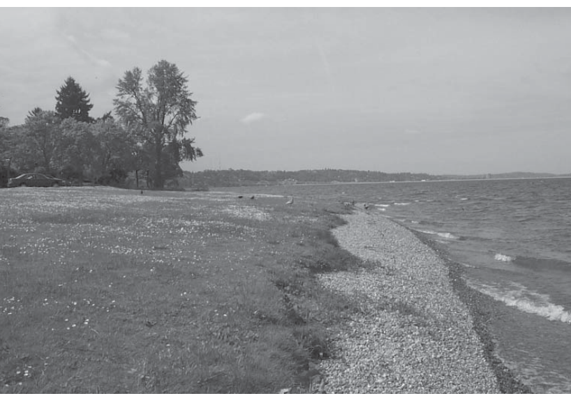
Partially restored Lake Washington shoreline. Note low gradient bank, fine gravel, and shallow water habitat.