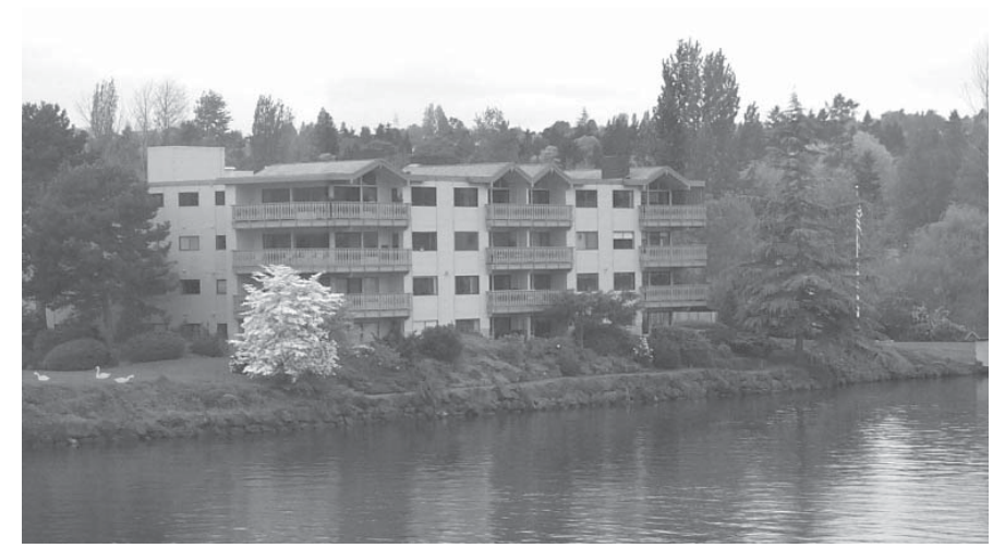
Developed and degraded Lake Washington shoreline. Note rip-rap, bulkhead, and relative lack of overhanging riparian vegetation.

populations and predation rates on juvenile salmonids. For example, the amount and spatial patterning of attached aquatic macrophytes can directly affect littoral zone fish abundance (Bryan and Scarnecchia 1992, Weaver et al. 1997). A low density of macrophytes usually increases the abundance of littoral zone fish. While shoreline development and an increased density of macrophytes may result in more habitat for