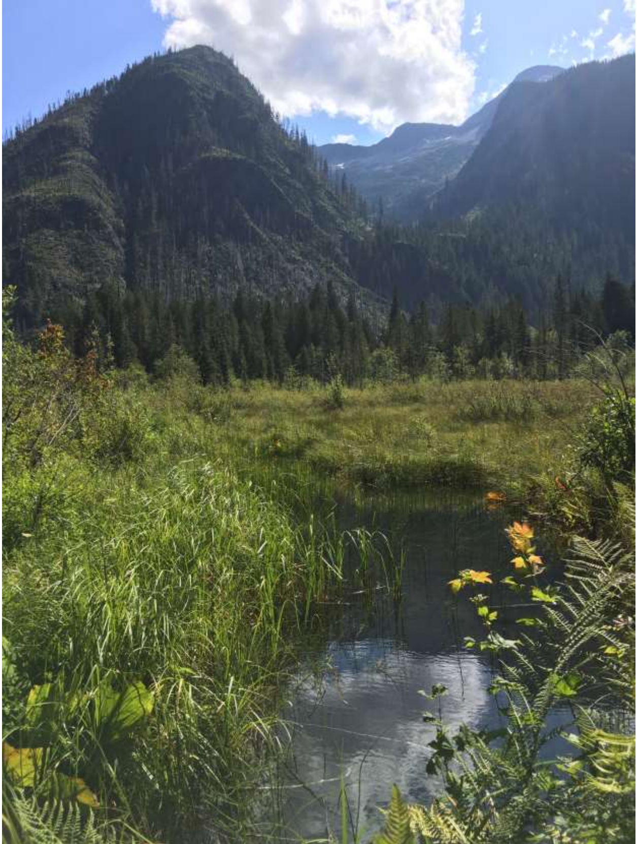
The view from the trail at the Ho-Dee-Doe site.