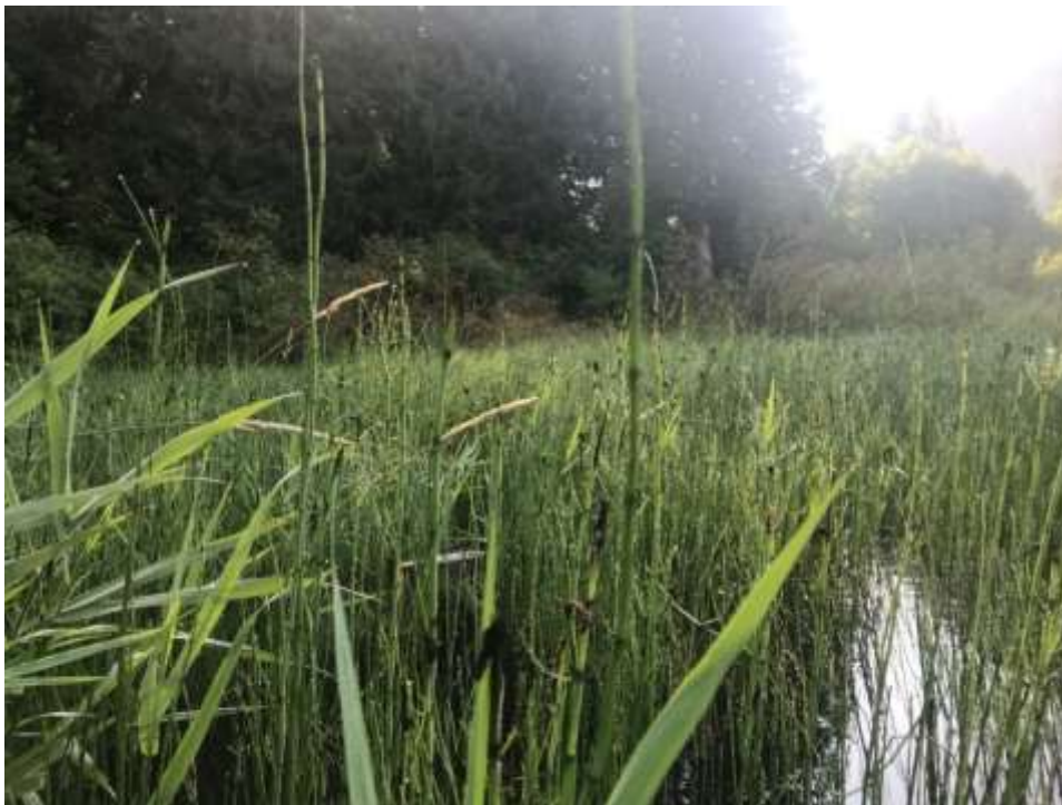
A typical scene of the treatment area at Hoe-dee-doe. Reed canary grass is interspersed with Equisetum . Grass photo is taken at eye-height; water is approximately 1 meter deep.