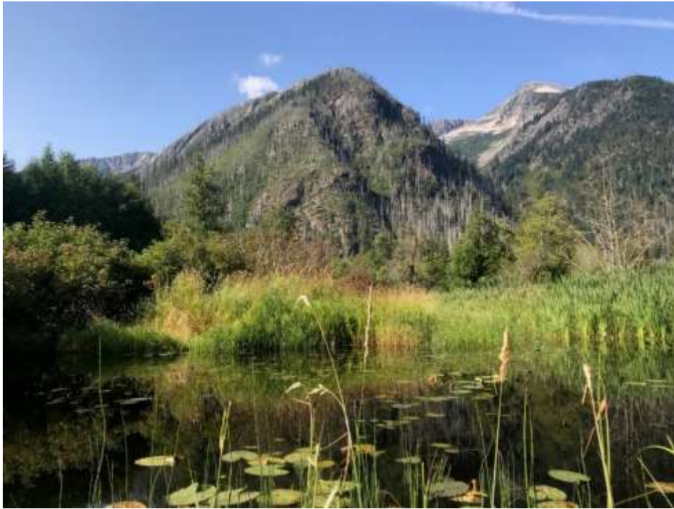
Reed canary grass grows amongst lily pads at Hoe-dee-doe.