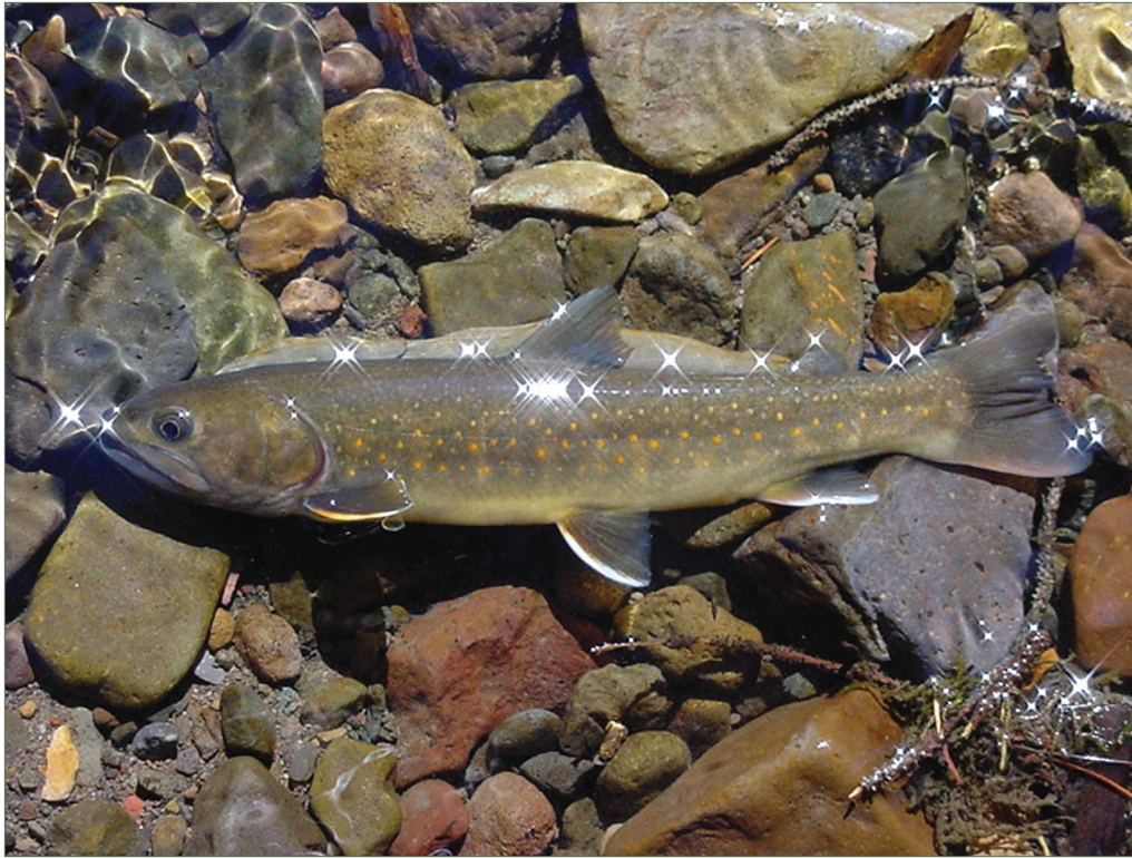
Bull trout.