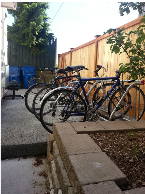
Bike Storage Common Area

315 10th Ave (LEED Platinum) MR | 5 dwelling units, 36 micros | 5 Stories above grade