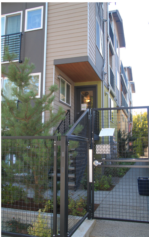
University District 4309 7th Ave NE