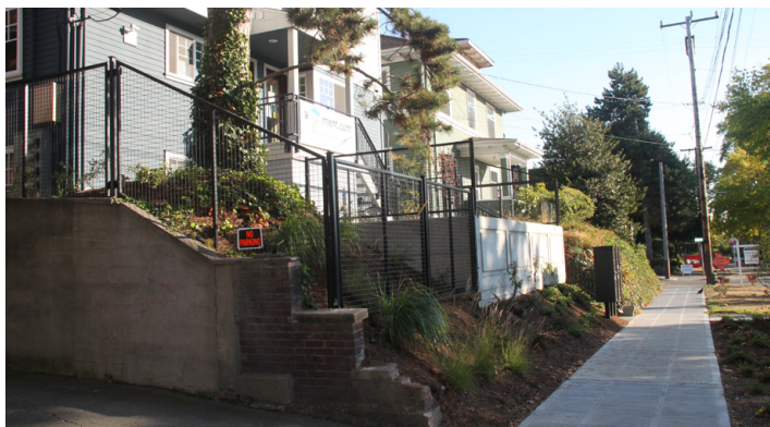
3 stories above grade, 1 story below grade