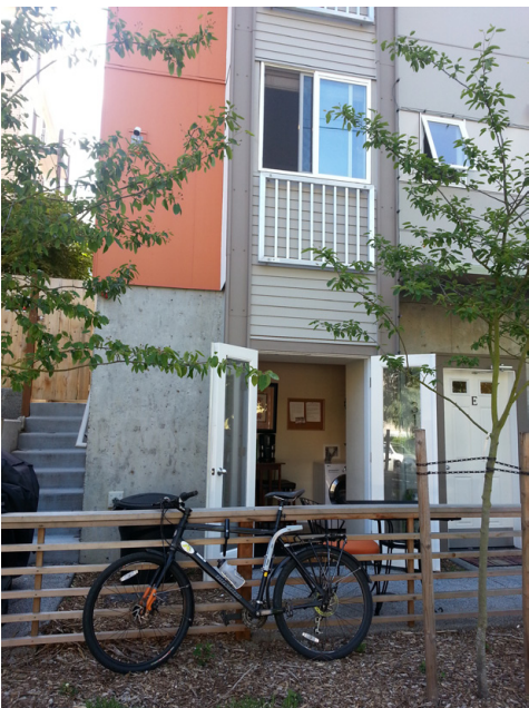
Shared Kitchen and Outdoor Seating