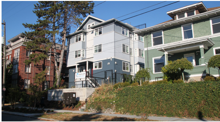
Capitol Hill 1304 E John St