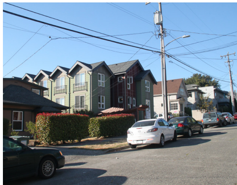
3 stories above grade, 1 story below grade