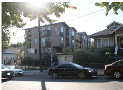
3 stories above grade, 1 story below grade