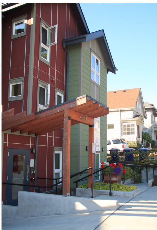
University District 4047 8th Ave NE