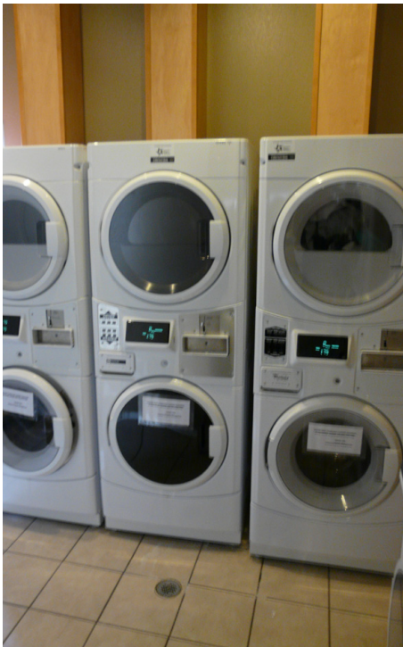
Shared Laundry Area