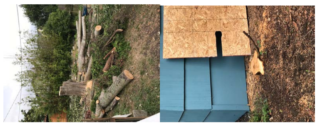
They cut more all around the building