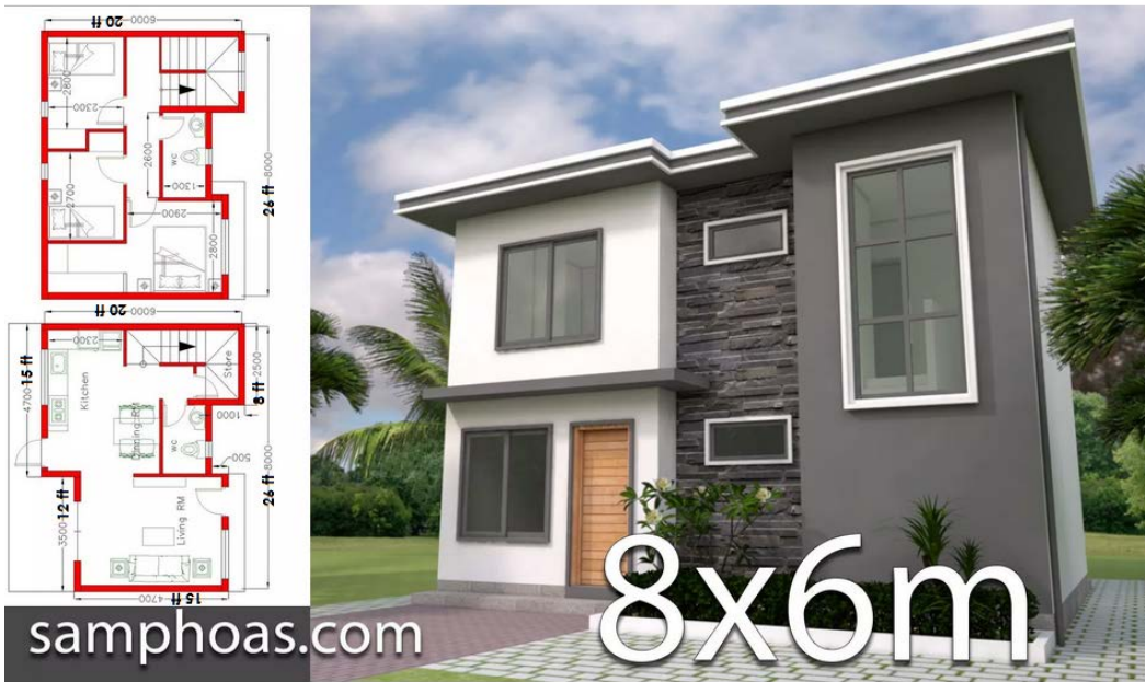
Realistic example: 26 ft by 20 ft = 520 SF level one + 480 SF level two = 1000 SF https://samphoas.com/plan-3d-home-design-8x6m-with-3-bedrooms/

Sent: Wednesday, July 17, 2019 at 3:28 PM