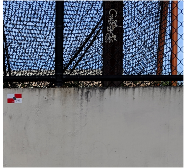
Optical target on a retaining wall.