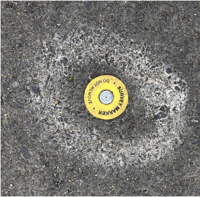
Survey point in a concrete foundation.