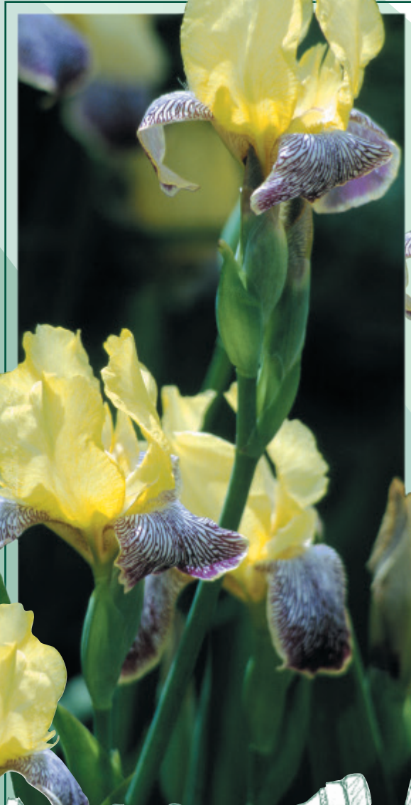
Iris germanica 'Gracchus'