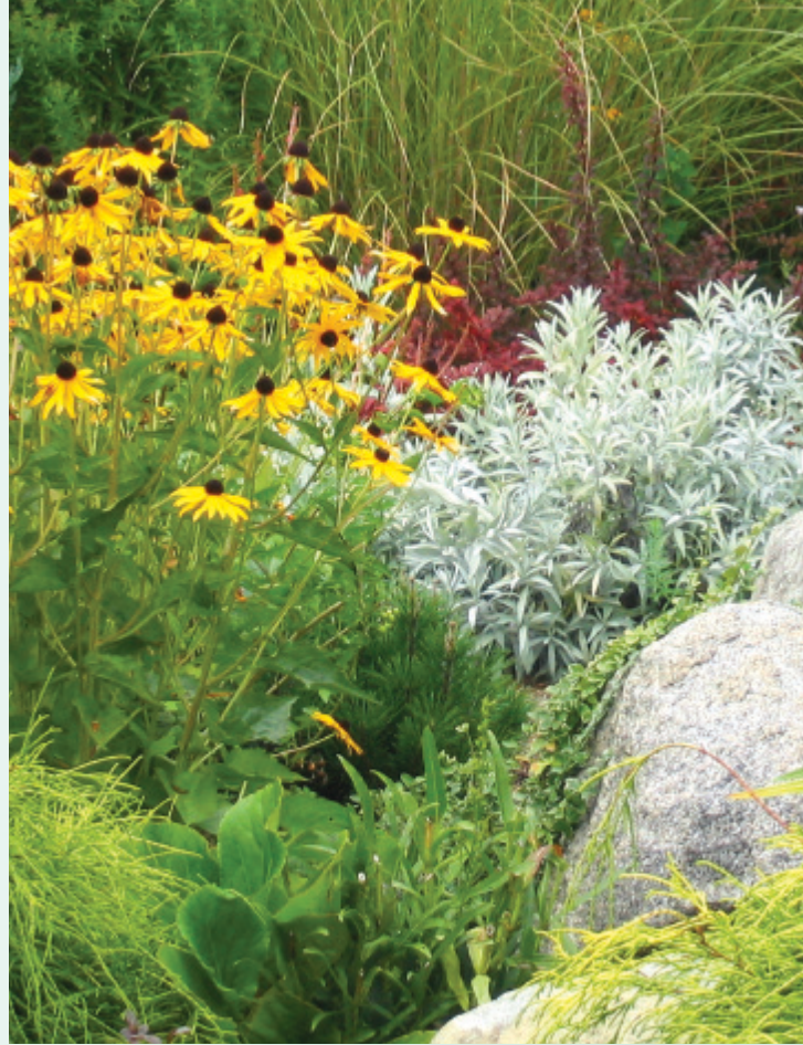
Waterwise Garden by Crooks Garden Design