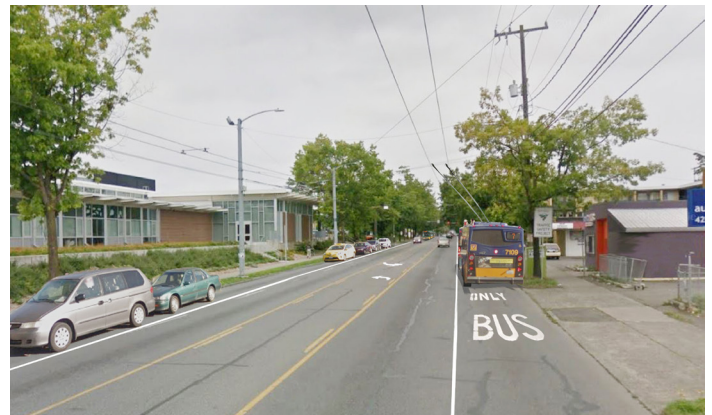
After construction (fall 2018)