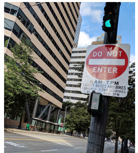
Examples of signs on the 3rd Ave Transit Corridor