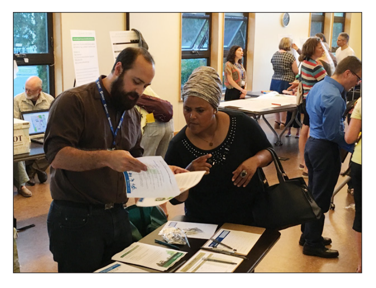
Sharing information at an outreach event