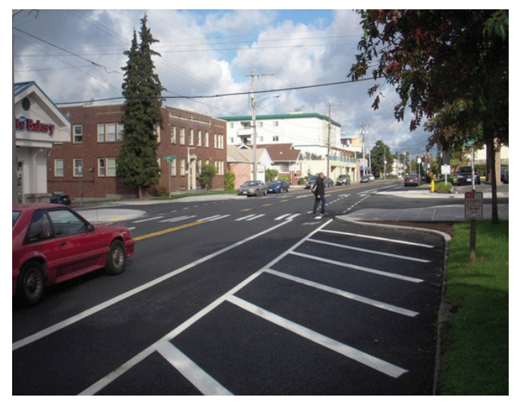
We're updating the street design to enhance safety and balance the many uses of our limited street space

Email is the best way to stay up to date during construction. We encourage you to sign up for email updates here: www.seattle.gov/transportation/35thNEpaving.htm.