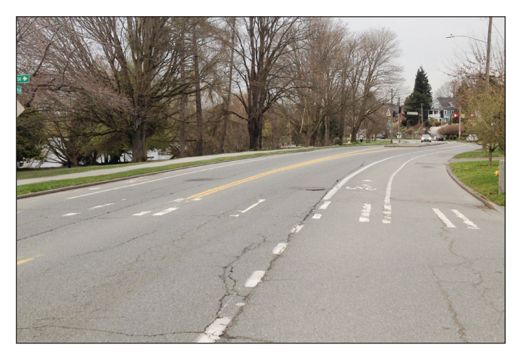
E Green Lake Way N & N 63rd St (looking north)

We prioritize paving based on pavement condition, traffic volume, geographic equity, cost, and opportunities for grants or coordination with other projects in the area.