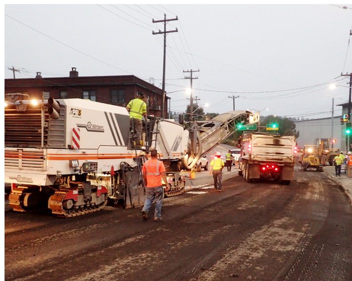
An example of crews grinding

Grinding and paving work will occur at night, between 9 PM and 5 AM. This allows crews to get work done quickly and reduce impacts to people moving around downtown during the day.