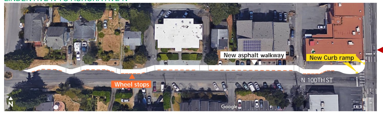
Parallel parking will be maintained along the new walkway above. Roadway graphics are for illustration purposes only (not to scale).