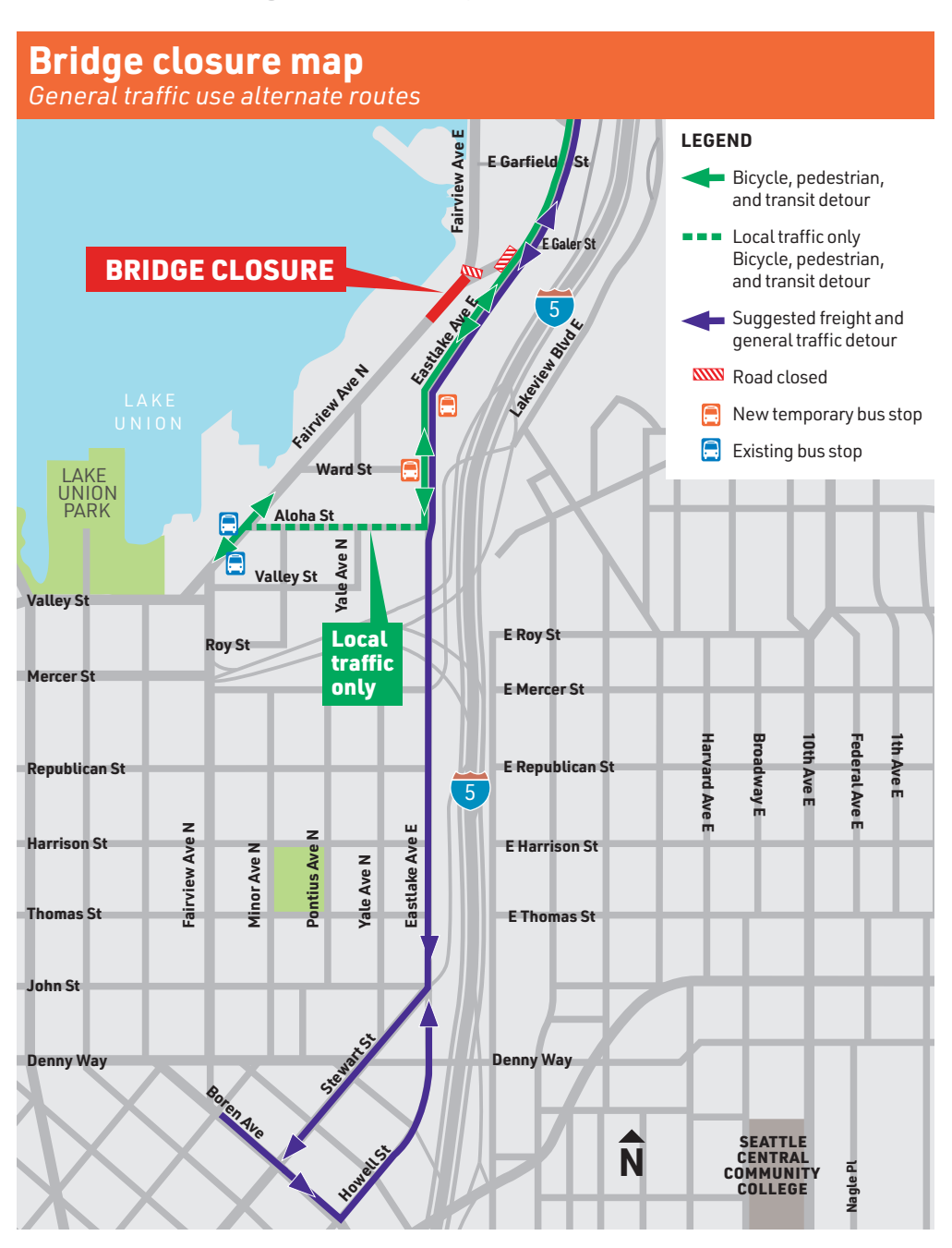
Transit, biking, walking, and local traffic detour routes shown on the map above are the result of working with communities near the bridge.