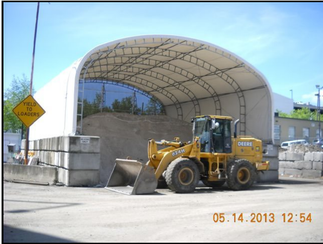
Figure 1 42 . Covered Storage Area for Erodible Material (gravel).