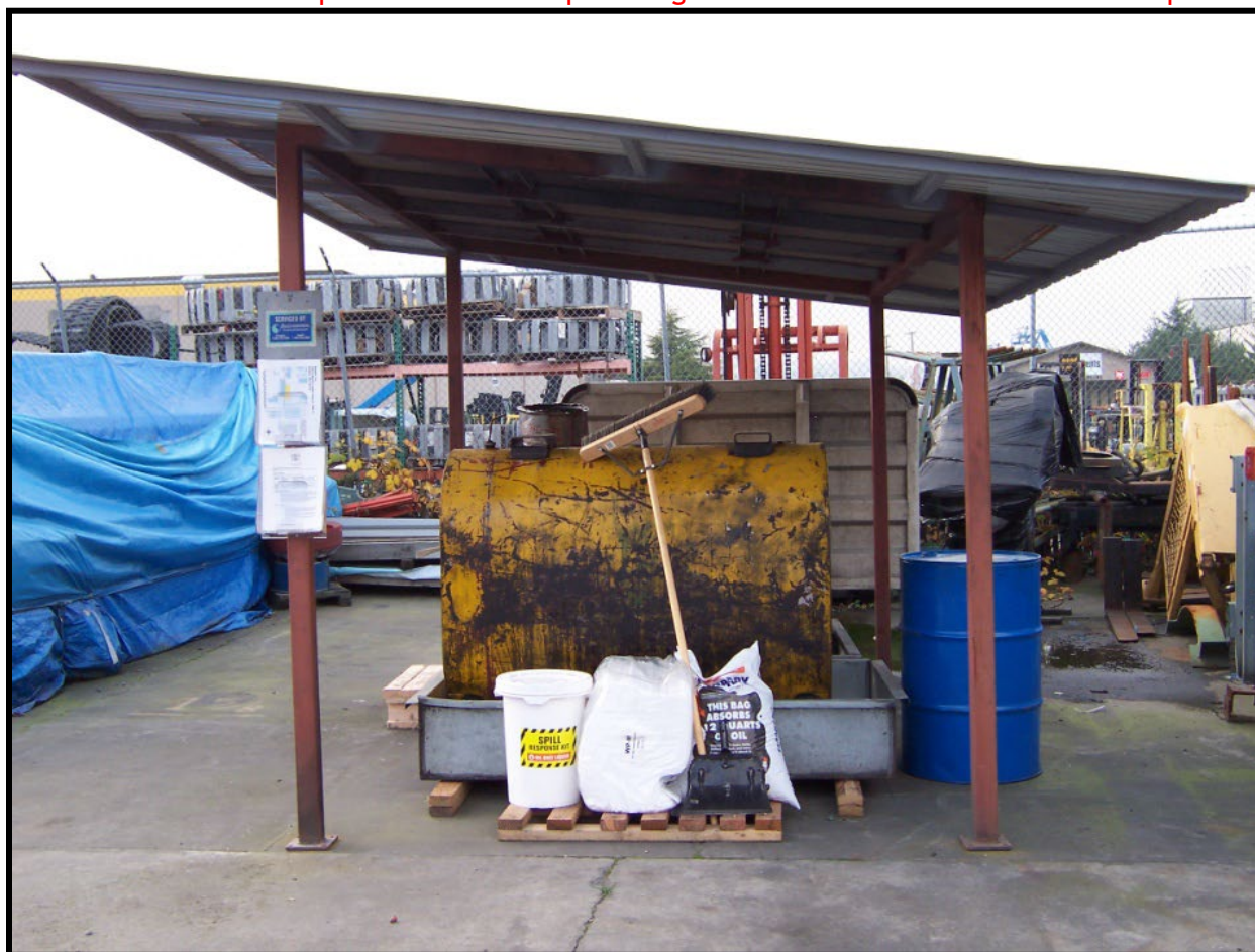
Figure 3-2 . Waste Storage Area with Spill Kit and Posted Spill Plan.

List the names and telephone numbers of public agencies to contact in the event of a spill.