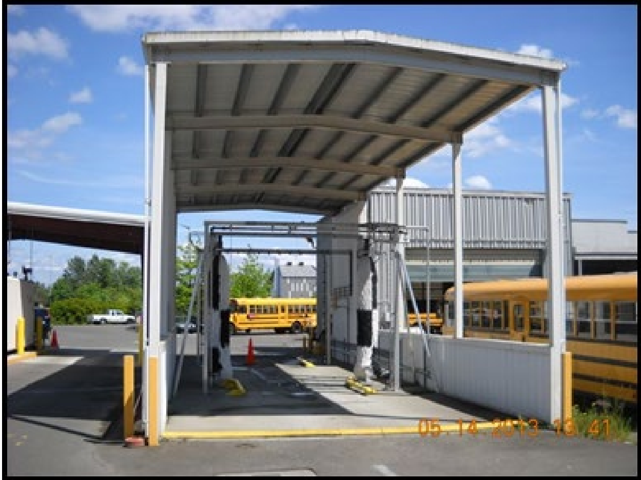
Figure 86. Car Wash Building with Drain to the Sanitary Sewer.