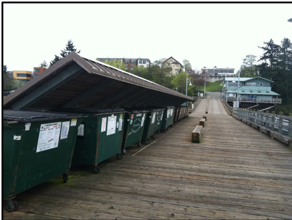
Figure 1. Covered Outdoor Storage of Solid Wastes in Suitable Containers.

damaged or leaking. Store damaged or leaking batteries in a covered, non-leaking secondary containment system. Keep battery acid neutralizing materials, such as baking soda, available near the storage area.