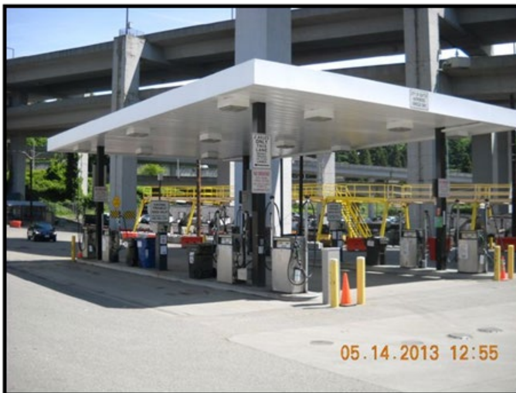
Figure 54. Roof at Fueling Island to Prevent Stormwater Run-On Contact with Rain.