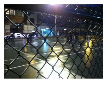
Bike Polo at Cal Anderson Park

The Judkins tennis courts were not used as highly as those at Cal Anderson, due to the lack of lights at the venue. The primary use of the two courts at Judkins took place on weekends and later in the spring and summer on weekday evenings. The bike polo organization used wooden planks to divide the courts and keep the ball from rolling into the other court.