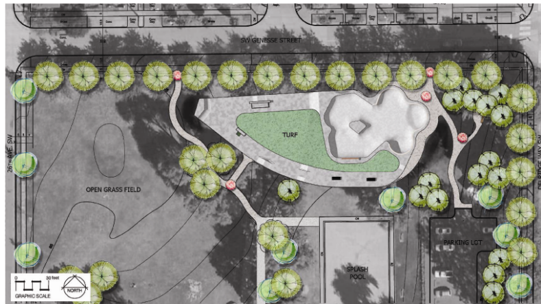
Delridge Park Skatepark Site Plan

The next public meeting will be at the end of June to get feedback on the schematic design. Public art has not been designated yet, but the community has been awarded a small and simple grant to try to bring more people into the community that will include a call to artists, develop a design and apply for the $100k for art.