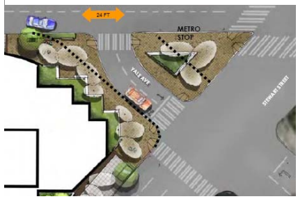
Figure 3: Improvements at Denny