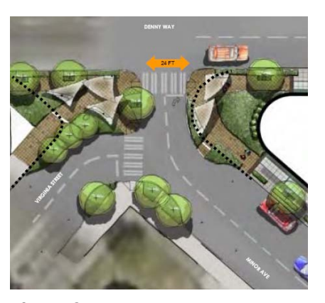
Figure 3: Improvements at Denny and Minor