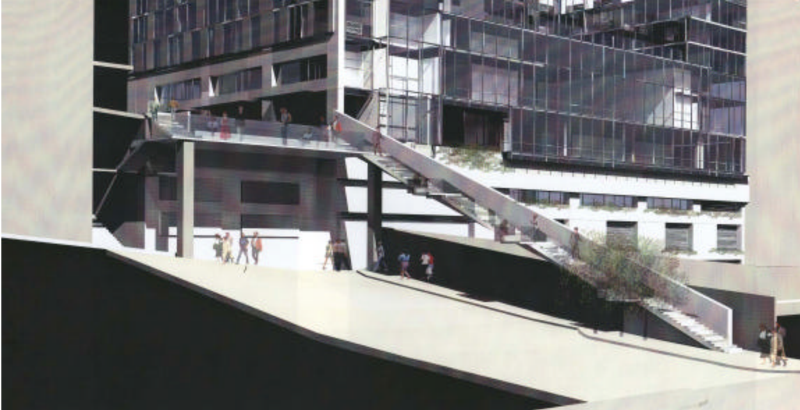
Concept design of hill climb assist and connection to the water front

The proponents explored three design concepts for the public stairs: staggered, switchback, and long narrow. The preferred concept was the long narrow staircase as it was narrower and less intrusive than the other options and provided more drama and experience for the user than the standard switchback approach. The stairs would be composed of glass and concrete and a clump of trees would be sited at the landing of the stairs on Union St. and Western Ave. The proposed stairs would be built ideally without columns increasing safety, visibility, and allowing a lighter presence on the site.