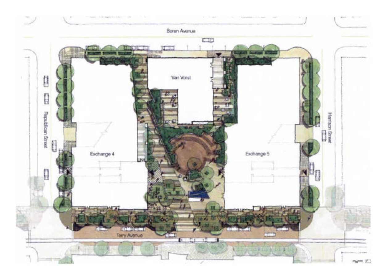
Interurban Exchange IV/V Concept Design

Right now biotech demand is not huge, believe that it will increase in 2006our goal is to start as early as June 2006 but will depend on when we get tenant late start June 2007 finished in construction to 2010 and 2011.