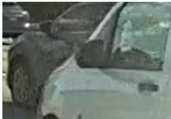
Close-up image of mirror from ICV.

OPA also reviewed SPD records and was unable to identify any reported collisions concerning the incident. Using GPS histories, OPA was able to locate two SPD vehicles in the vicinity of the van at the approximate time of the collision, but ICV from both vehicles showed neither was driving on I-5, nor were the vehicles operating in emergency response.