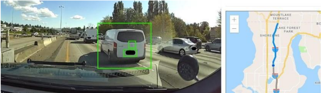
ICV image depicting CM#1's van.

OPA compared the video to available ICV. OPA located an ICV video that depicted the work van located near the location of the incident with the driver's side mirror still intact.