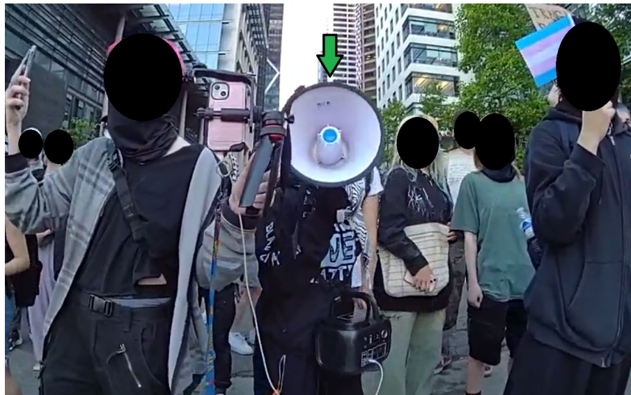
The green arrow points to CP#1.

On May 27, 2025, BWV 1 captured NE#1 conducting crowd control at an intersection, where he stood alongside other officers while facing counter protesters. Eventually, CP#1 positioned herself in front of NE#1 and repeatedly shouted, “Trans rights are human rights” into a bullhorn, which was echoed by the crowd.