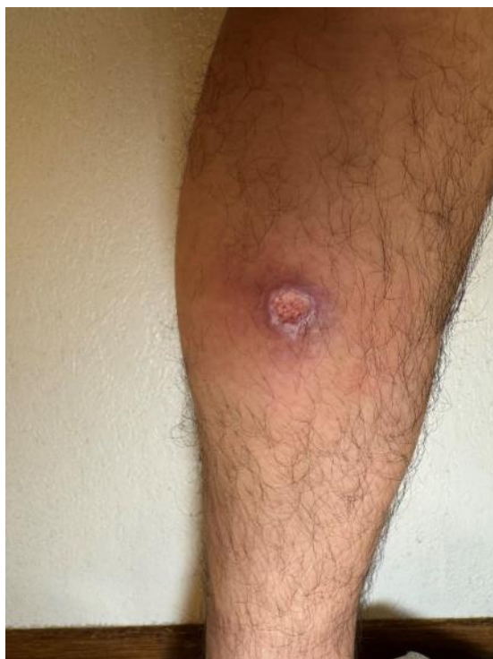
18 Days Later