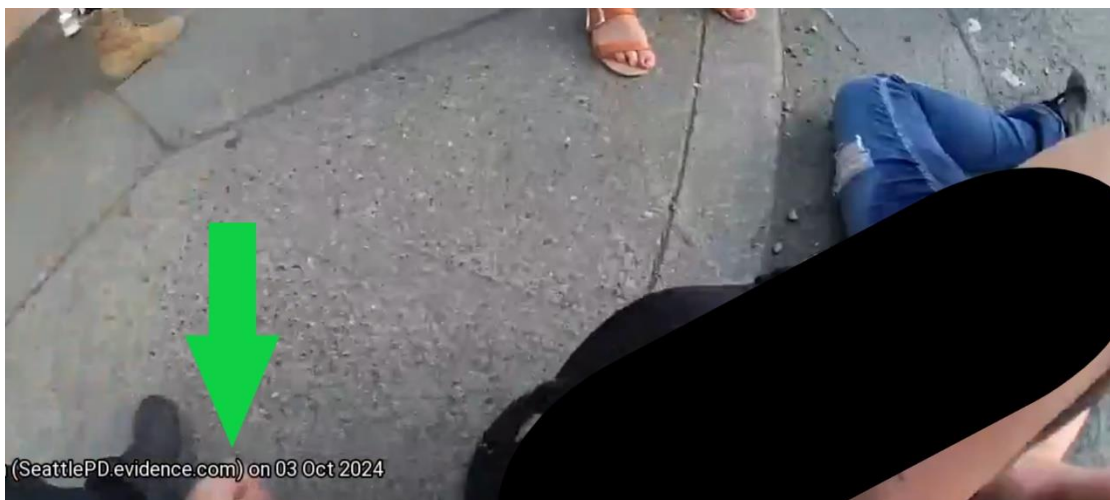
NE#1's left fist (green arrow) during the second punch.

NE#1 and Witness Officer #1 (WO#1) secured CM#1's hands and applied handcuffs. A bystander yelled at NE#1 about his punching CM#1's face. NE#1 responded, "She just bit me!"