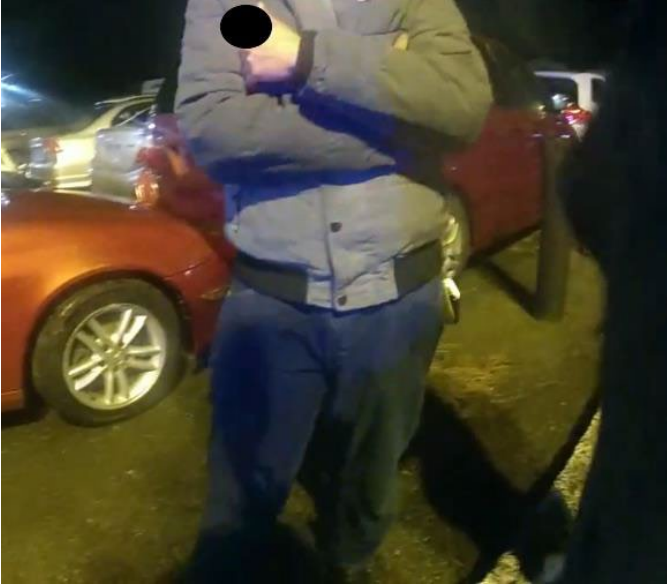
CM#1 viewed from the front.