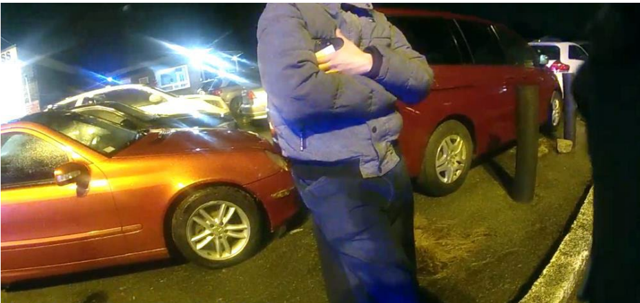
CM#1 viewed from the left.