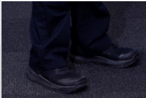
Photograph of NE#1 on the left wearing her working boots at her sergeant promotion ceremony. Enlargement on the right: Under Armor, Black, Size 8 with a toe cover

WS#1 provided a photo of her working boots and inserts that are Under Armor, Black, Size 8 with a toe cover. WS#1's boots had custom made green orthotics and "red fuzz" from her red WSU socks WS#1 wears regularly. It is undisputed that the boots of WS#1 and NE#1 are very similar. 2