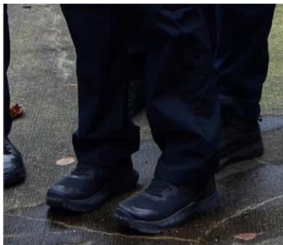
WS#1's wearing her Boots