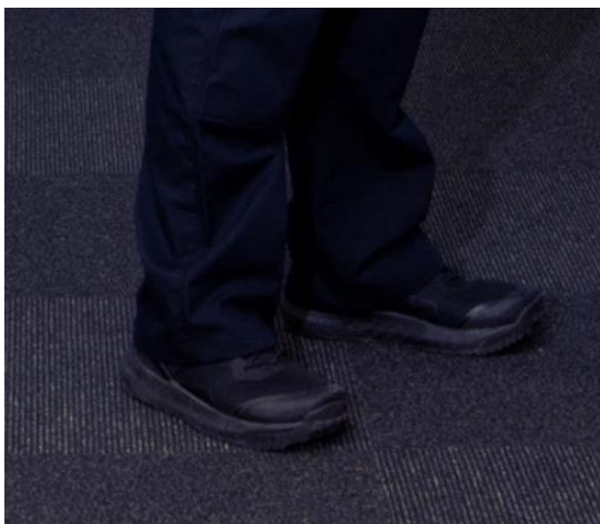
NE#1's wearing her Boots

WS#1 provided a photo of her working boots and inserts that are Under Armor, Black, Size 8 with a toe cover. WS#1's boots had custom made green orthotics and "red fuzz" from her red WSU socks WS#1 wears regularly. It is undisputed that the boots of WS#1 and NE#1 are very similar. 2