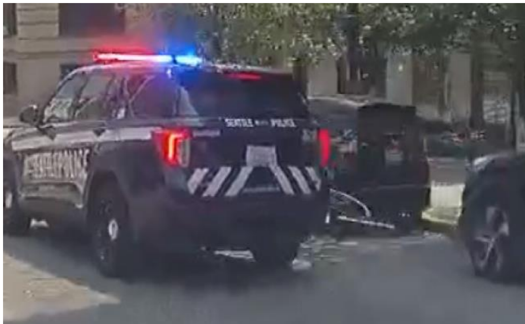
The Complainant Tumbles with Bicycle on Roadway

NE#1 got out of his vehicle immediately to take the Complainant into custody, as well as WO#3 who was approximately five to ten feet behind the Complainant when he saw him fall from his bicycle. NE#1 and WO#3 were both surprised; however, when the Complainant got up from the ground after falling and continued to run from them. The Complainant continued to run until he hit his left leg against a parked car and continued to run. NE#1 and WO#3 then saw the Complainant start to walk with his hands up towards NE#1 and both officers arrested the Complainant and took him into custody. WO#3 went hands on first and NE#1 assisted in arresting the Complainant who resisted. NE#1 broadcasted they were taking the Complainant into custody. NE#1 took photographs of the scene of the bicycle crash and inspected the nearby parked vehicles for damage at approximately 14:59. NE#1 later indicated he considered this inspection inconclusive. WO#2 advised the Complainant of his Miranda Rights upon arrival and requested the Seattle Fire Department (SFD).