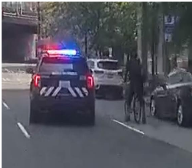
NE#1's Patrol Vehicle Just Ahead of Complainant

“When I look[ed] over to my passenger window, I saw him going, he went down, uh, falling to the ground. I [got] out of my vehicle.”