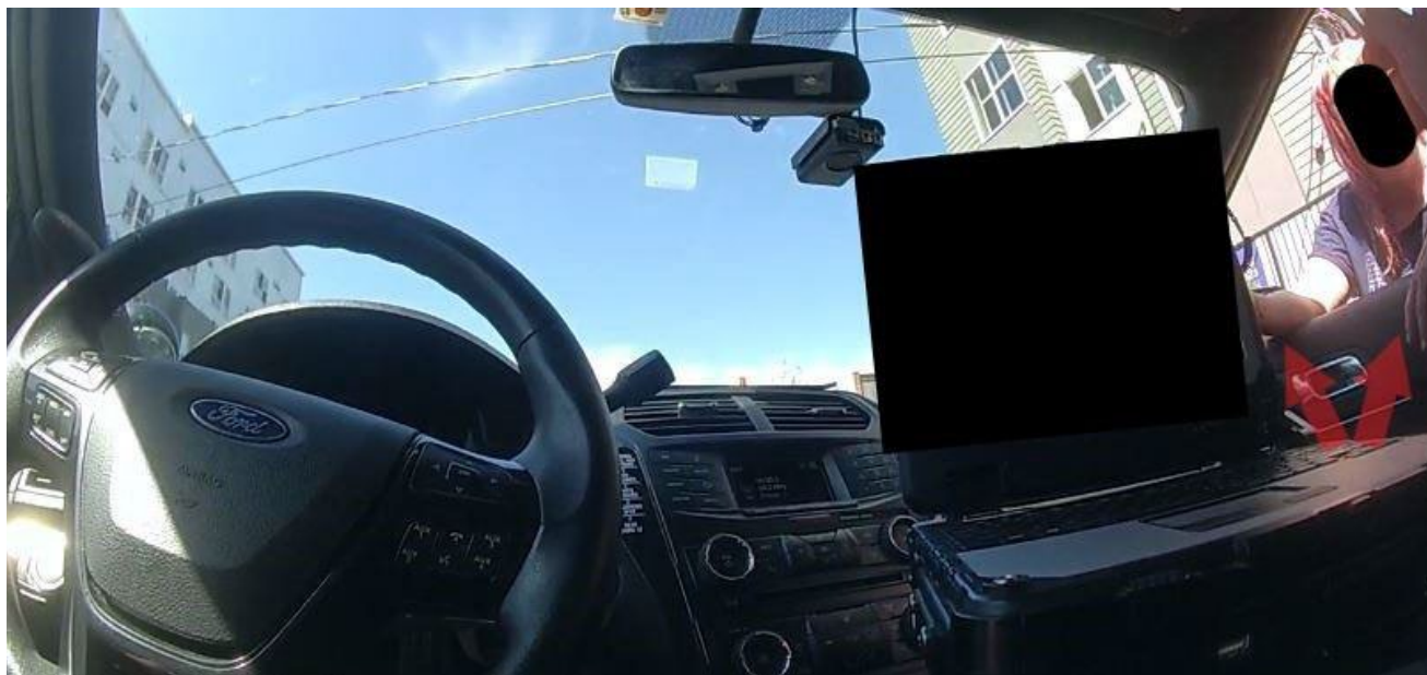
Still from NE#1's BWV, as NE#1 stated, "Get your hand out of my fucking car."

BWV depicted NE#1's interaction with the Complainant. NE#1 arrived at the incident location, advised dispatch that he wanted to meet the Complainant outside, and noted that he did not have his department cell phone. NE#1 spoke with the Complainant through his vehicle's open passenger window. After confirming the Complainant's name, NE#1 said, "We just tried to call you. You didn't answer." As NE#1 and the Complainant spoke, the Complainant leaned her right elbow/forearm and left hand onto NE#1's passenger side door through the open window. The Complainant gestured with her hands, and NE#1 interrupted, "Get your hands out of my fucking car."