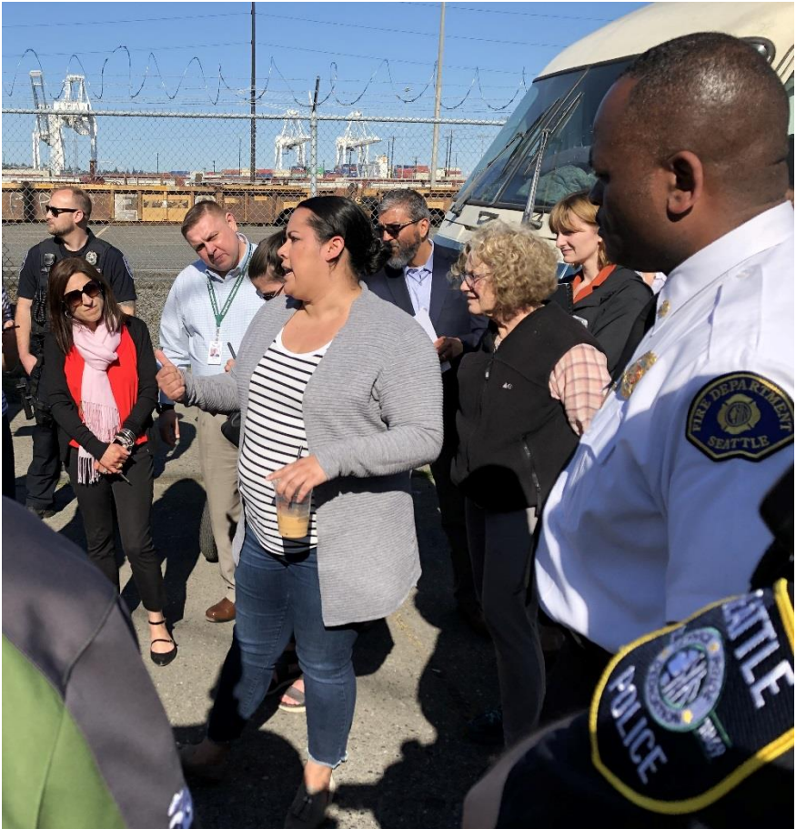
Business leader talks to City representatives about public safety issues in SODO.