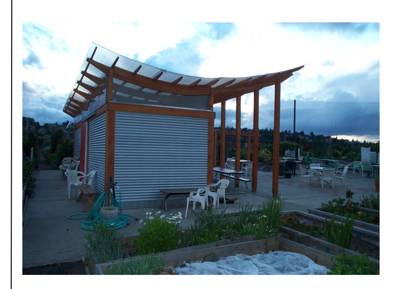
Interbay's shed needed a permit

Signage rules depend on the zone the garden is in. Step 1 is to find out your zoning and then check the code at: <a href="http://clerk.ci.seattle.wa.us/~public/toc/23-55.htm">http://clerk.ci.seattle.wa.us/~public/toc/23-55.htm</a>