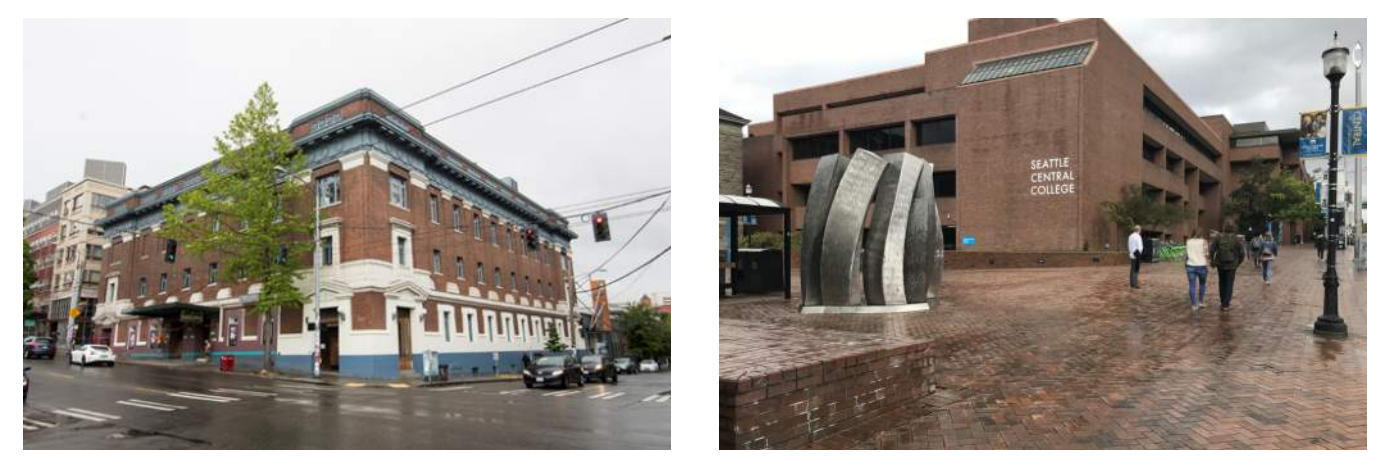
Fine Arts Building

Existing Seattle Central Building Eligible for Landmarks Nomination The existing Seattle Central Campus does not include any existing Landmark-designated structures, nor are there any within the proposed MIO boundary. There are, however, several structures that are eligible, due to their age and the regulations of the City of Seattle for the nomination process. Buildings eligible for nomination are known to include: