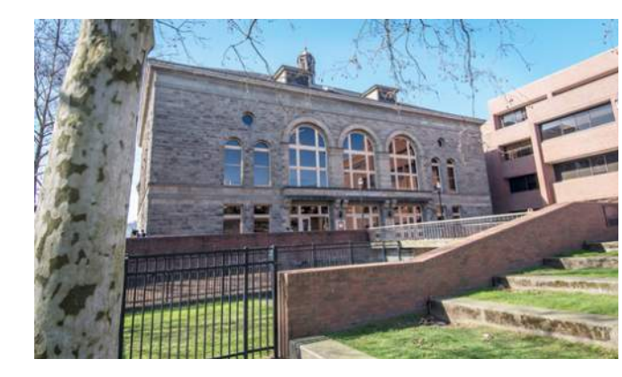
Broadway Performance Hall

/The 2001 SCC Master Plan included a MIMP Condition that required that "SCC shall preserve the historic character of the north and west facades and the lobby of the Masonic Temple Building" (also known as the Egyptian Theater). It is expected that the Egyptian Theater, if nominated for Landmark Preservation, would be determined by the City of Seattle to be a significant structure, and be granted Landmark status.