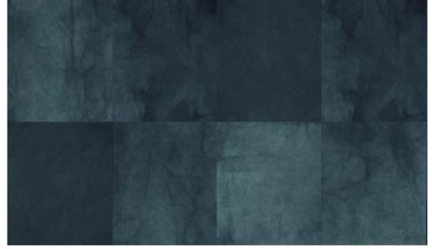
Carpet Tile Inset