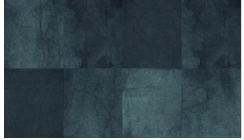
Carpet Tile Inset