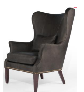
Proposed Furniture Grouping