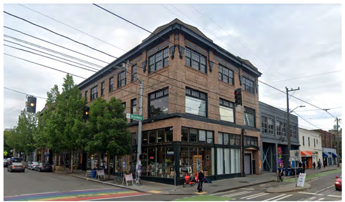
Tyson Automobile Company (1912), 903/905 E. Pike. Cited as potentially eligible in Neighborhood Commercial Districts context statement.