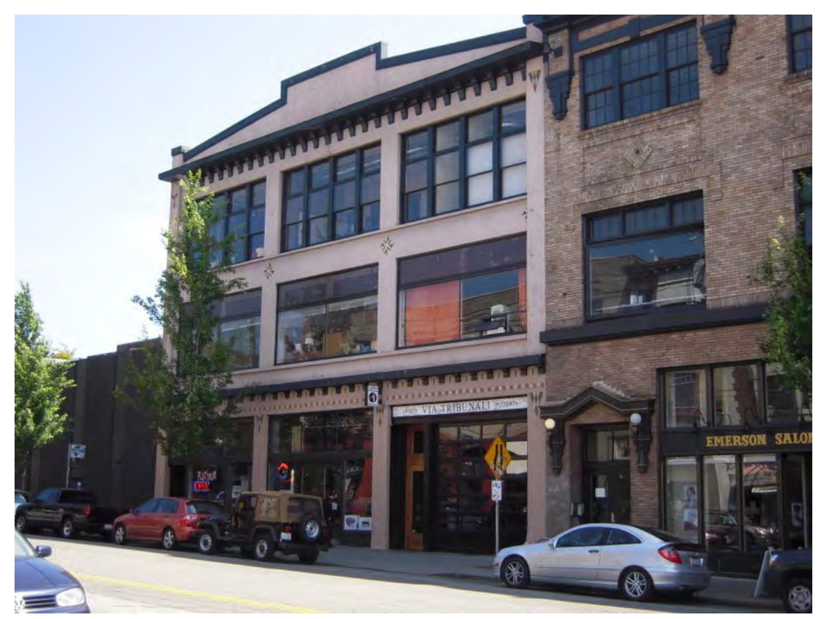
Graham Motor Cars (1912), 915 E. Pike Street. Also designed by Voorhees; cited as potentially eligible in Neighborhood Commercial Districts context statement. (DON, 2010)