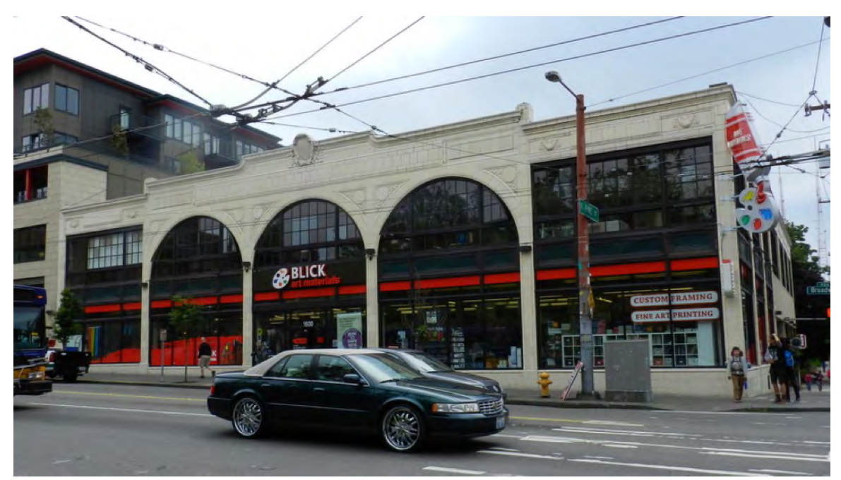
Packard dealership, later Pontiac (1925), 1600 Broadway, now Blick Art Materials. Cited as potentially eligible in Neighborhood Commercial Districts context statement. (DON, 2011)

Packard dealership (1925), 1120/1124 Pike, now Starbucks Reserve Roastery. Cited as potentially eligible in Neighborhood Commercial Districts context statement. (Joe Mabel, 2018)