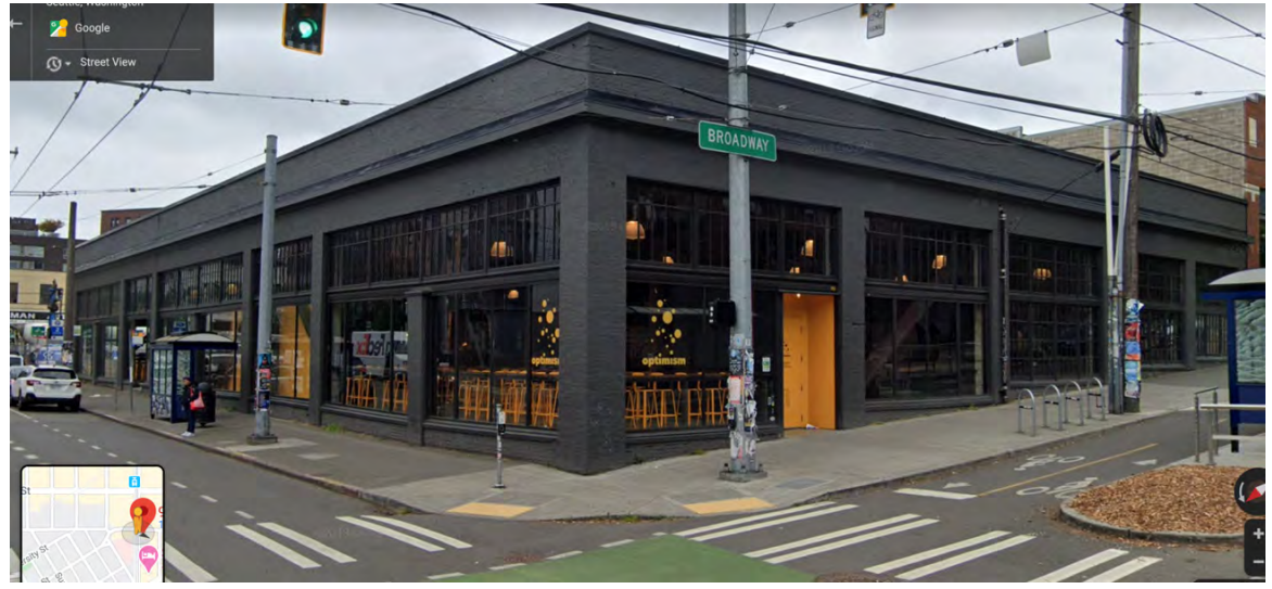
Great Western Motors (1920), 905 E. Union Street, now Optimism Brewing. Also designed by Voorhees.