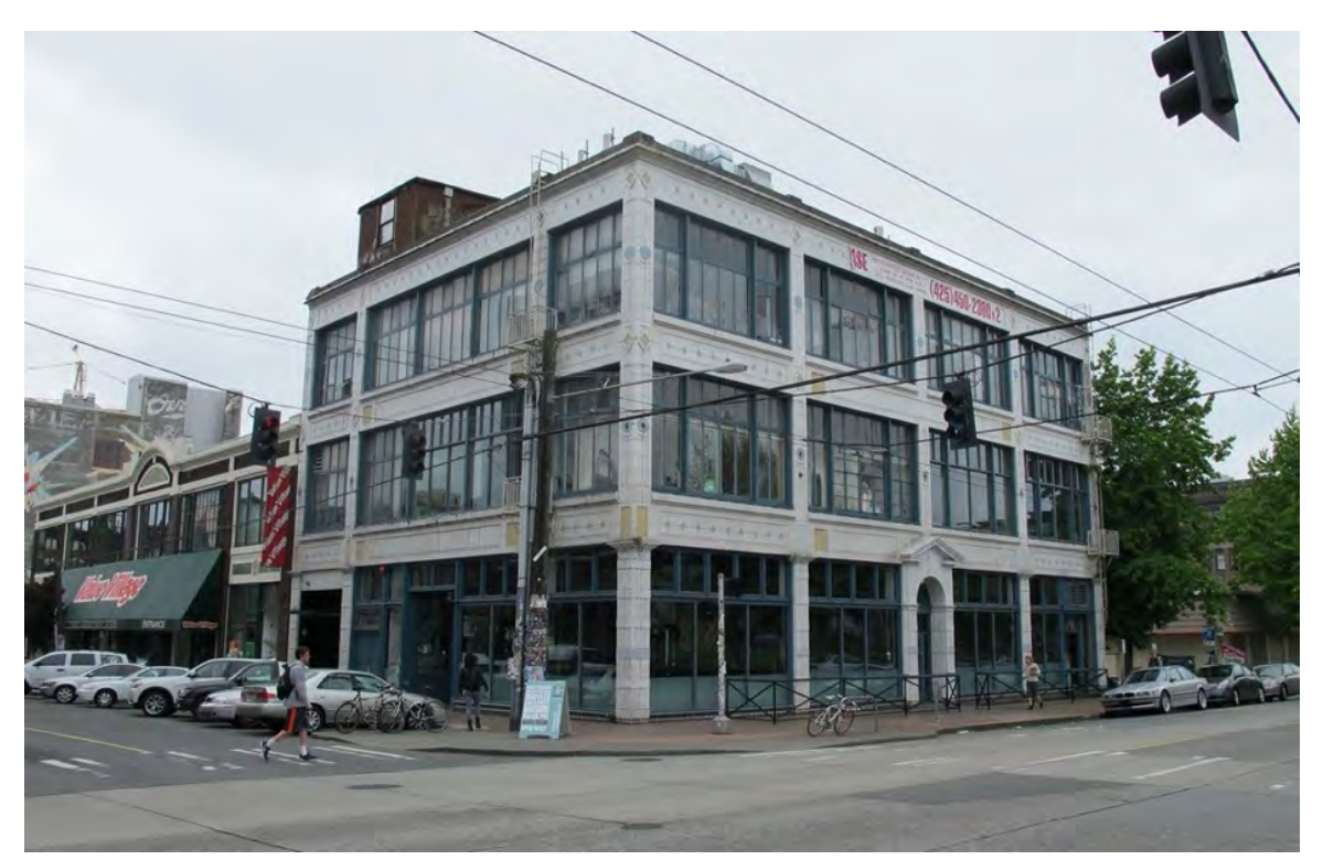
White Motor Company/Colyear Auto Sales, later occupied by REI (1918), 1021 E. Pine, now a Seattle landmark. (DON)