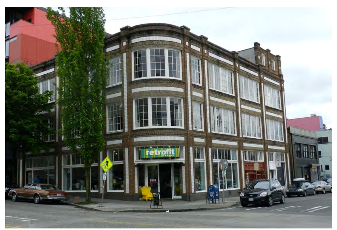
Liebeck Garage (1916), 1101 E. Pike. Cited as potentially eligible in Sound Transit EIS; currently under consideration as a Seattle landmark. (DON, 2011)