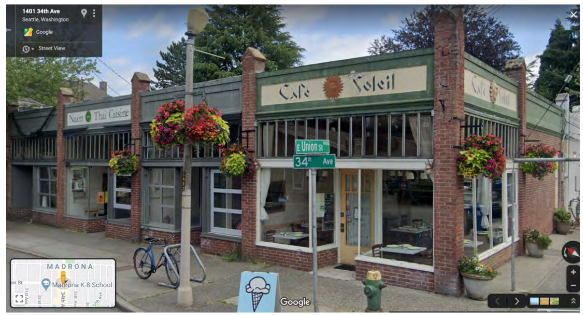
Neighborhood commercial building (1924), 1400 34th Ave. Also designed by Voorhees. (Google Maps)