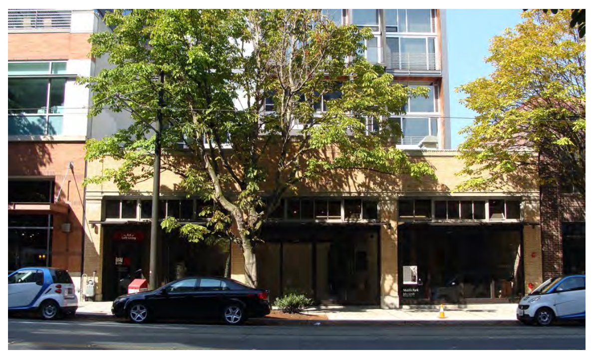
Nash Motors Co. (1927), 325 Westlake Ave N. Also designed by Voorhees. (DON, 2014)