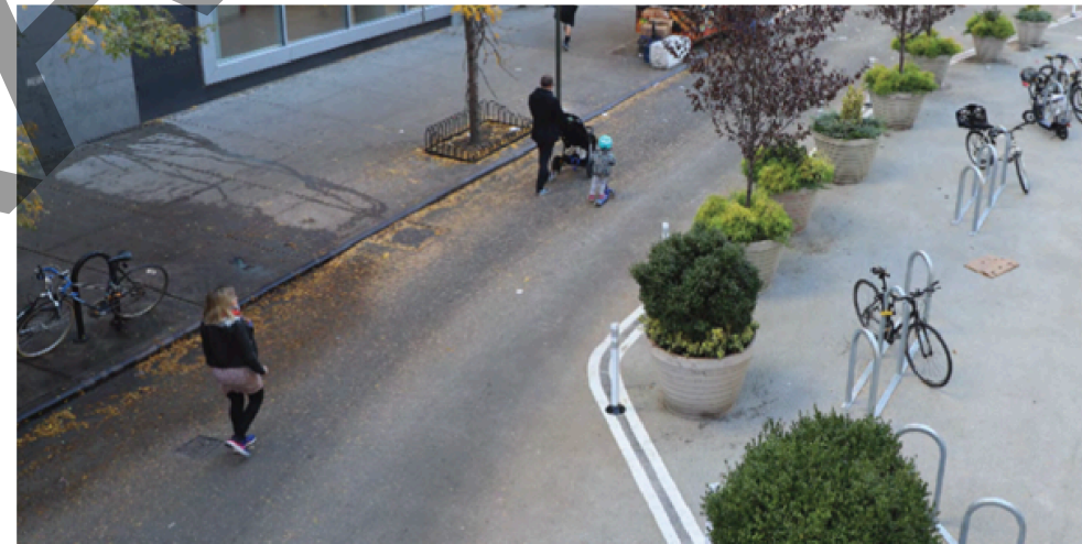
Example of paint and planter interim curb bulb