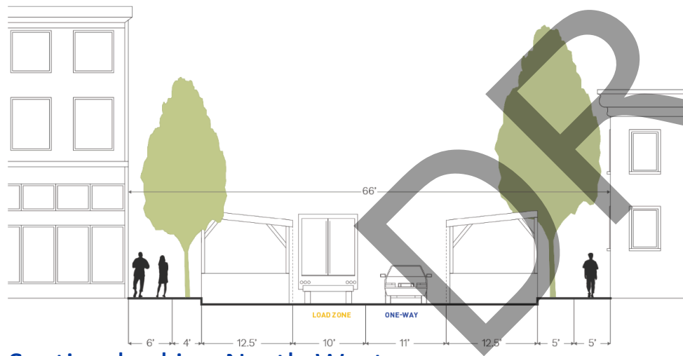
Section looking North-West