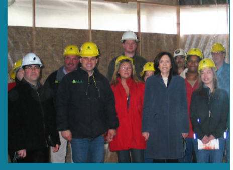
Senator Maria Cantwell, surrounded by construction workers and tenants of nearby Dorothy Day House, holds a press conference at Bakhita Gardens to highlight federal stimulus funding that along with Housing Levy funds allowed construction on the housing to continue despite the recession.

During 2009, construction continued on nine multifamily projects funded by OH, resulting in over $71 million of construction activity. Two homeownership projects developed on surplus City land transferred to the nonprofit agencies in exchange for affordable housing generated $29 million in construction activity in 2009.