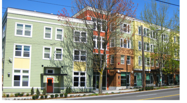
Downtown Emergency Service Center's Rainier House, a 50-unit permanent supportive Housing First project for chronically homeless men and women with mental illness, opened in February 2009. Supportive services will help residents to remain housed for the long-term, ending their tenures on the streets and in shelters.

Finally, at a time when access to capital for the purchase of homes is severely limited, OH funding leveraged over $13.3 million in mortgages for first-time homebuyers. This helped reduce inventory of unsold and foreclosed homes.