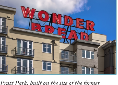
Pratt Park, built on the site of the former Wonder Bread factory in the Central District, used the Multifamily Tax Exemption Program, setting aside 50 of the 244 units as affordable for working families.