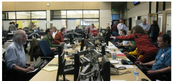
2: Infrastructure Table at work