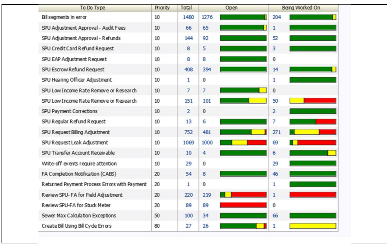
Exhibit 2: Supervisor To-Do Report