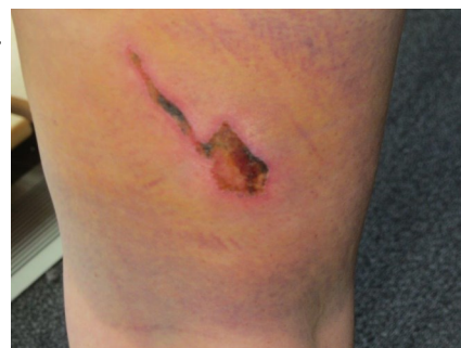
One woman's wounds from impact sponge