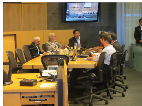
Councilmembers and SPD brass

The CAO policy, dated Oct. 31, 2013, notes the increasing number of cases sent for filing decisions by SPD. "Most often, these cases represent a delicate and difficult balance between preserving an individual's right under the First Amendment and maintaining the health and safety of our community."