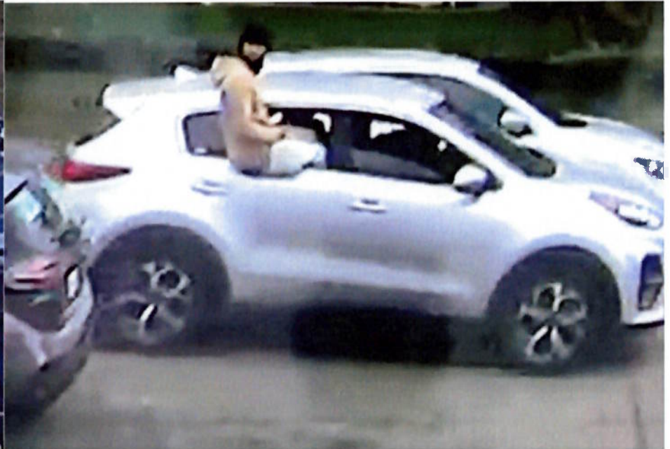
Image from security camera of suspect from Robbery (2023-4303)