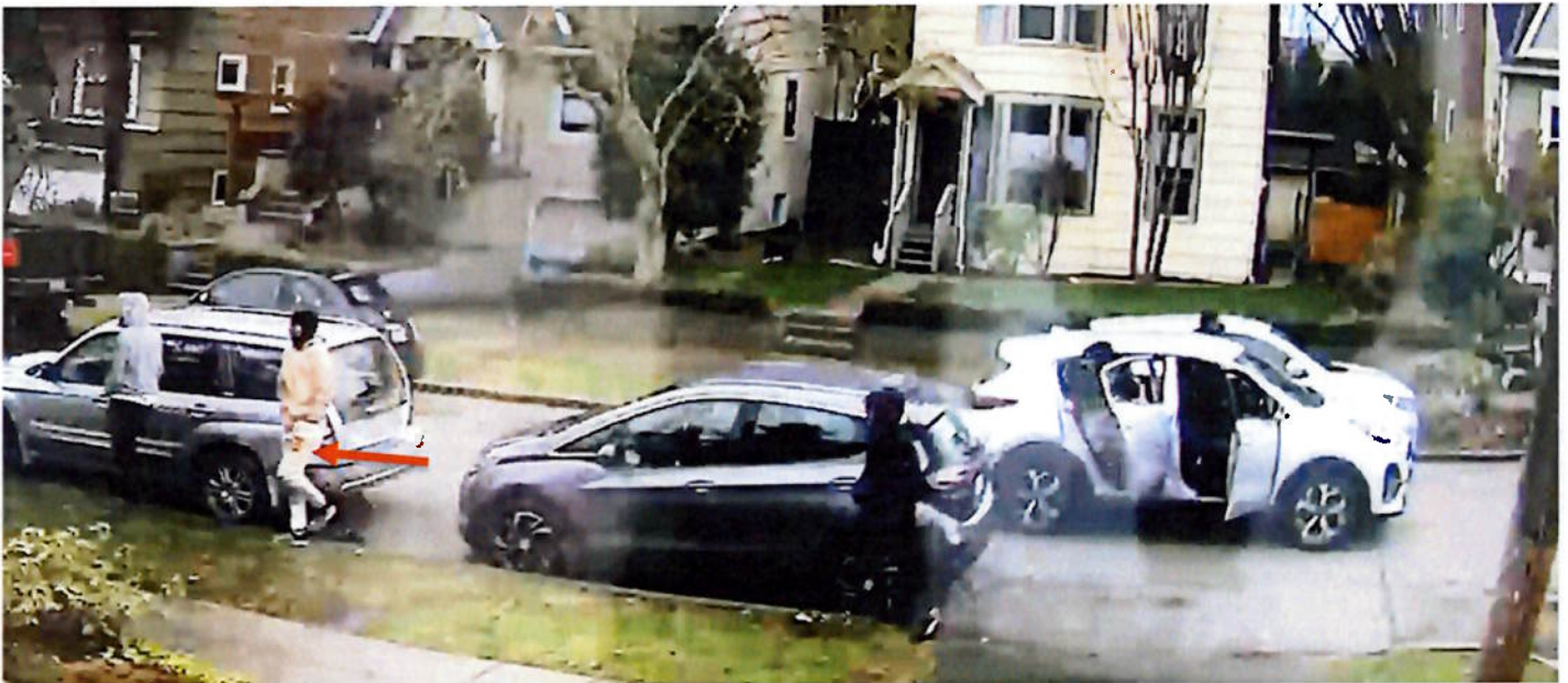
Suspects from vehicle just prior to Robbery (2023-4303)