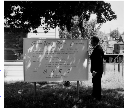
Seattle Urban Renewal Enterprise (SURE) sign at 114 21st Ave, 1960.