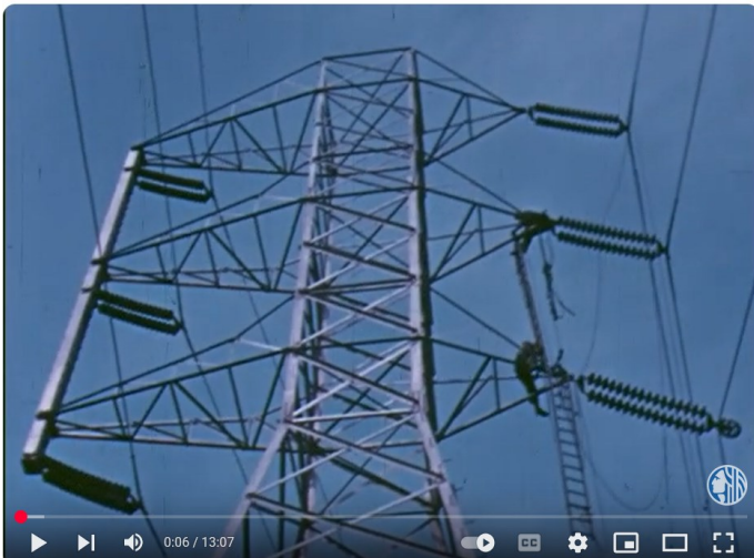
Item 14 , Record Series 1204-05, SMA.

Recently posted to SMA's YouTube channel is a video of silent footage showing City Light workers performing maintenance on transmission towers in 1966. The footage includes shots of workers high on the towers, including some views of the Skagit River area as well as detailed closeups of rolling cable and the work performed.