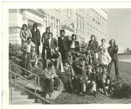
Franklin High School Jazz Lab Band, 1974.