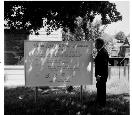
Seattle Urban Renewal Enterprise (SURE) sign at 114 21st Ave, 1960.

A new HistoryLink article on the history of 114 21st Ave, which between 1959 and 1962 served as the location of the Seattle Urban Renewal Enterprise (SURE) model home and office, is both illustrated and informed by materials held at SMA. Another recent HistoryLink article on the Dearborn Street regrade also features SMA photos, as does a Seattle Times article on the former municipal Seattle Ski Park at Snoqualmie Pass. And a recent KUOW story on former City Councilmember Wing Luke features archived audio held by SMA from a 1963 hearing on the Open Housing Act, also featured in our online Open Housing Exhibit .