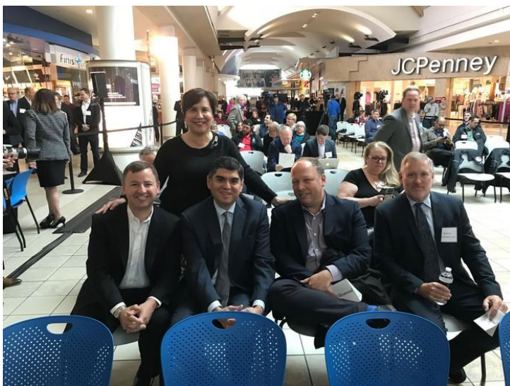
Councilmember Juarez appears at NHL practice facility announcement at Northgate Mall, October 8, 2018. Seattle City Council, led by Council President Juarez, brought National Hockey League team the Kraken to Seattle beginning in 2018. The project transformed Northgate Mall into the team's headquarters and training facility. Image 208280 , Series 4642-06, SMA.