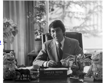
Mayor Royer at his desk on January 23, 1978. Image 207957 , Series 2613-07, SMA.

Photos from SMA's collections continue to illustrate news stories from various sources, including: a Literary Hub story on the 1999 WTO protests; a story in the South Seattle Emerald about the history of Juneteenth; a Real Change article on the removal of a longtime Seattle newsstand; and articles from local news agencies reporting on the recent death of former mayor Charles Royer, such as this one from the Seattle Times.