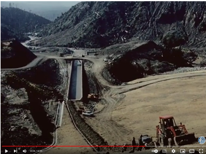
Tolt Dam construction, circa 1960s. Event 16115 , Record Series 3902-01, SMA.

Recently posted to our YouTube Channel is a series of short videos documenting the construction of the Tolt Dam in the early 1960s. The footage shows aerial and ground-level views of the dam taking shape across the backdrop of the Cascade foothills.