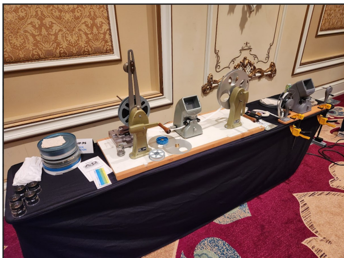
A hands-on station during the AV102 workshop at NWA 2024.

City Archivist Anne Frantilla participated on a panel presenting about Sustainable Outreach, sharing strategies for using exhibits, presentations, events, and public programs to maintain a continuous outreach presence. Photo Archivist Jules Irick presented on Collaborative Disaster Response Networks, specifically the Seattle Heritage Emergency Response Network (SHERN) , discussing how such networks can support member organizations and facilitate partnerships. The presentation also touched on developing and implementing disaster preparedness programs at the institutional level.