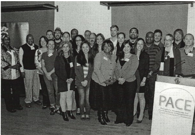
People's Academy for Community Engagement (PACE) event, circa 2012. Box 1, Folder 4, Record Series 5751-14.

Also recently processed are two series from the Department of Neighborhoods. The People's Academy for Community Engagement (PACE) Records ( Record Series 5751-14 ) contain records from a leadership training program designed and operated by