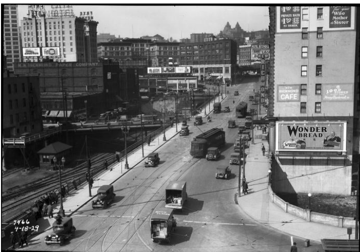
Second Ave S. Extension at Jackson St., April 18, 1929. Image 3378 , Series 2613-07.