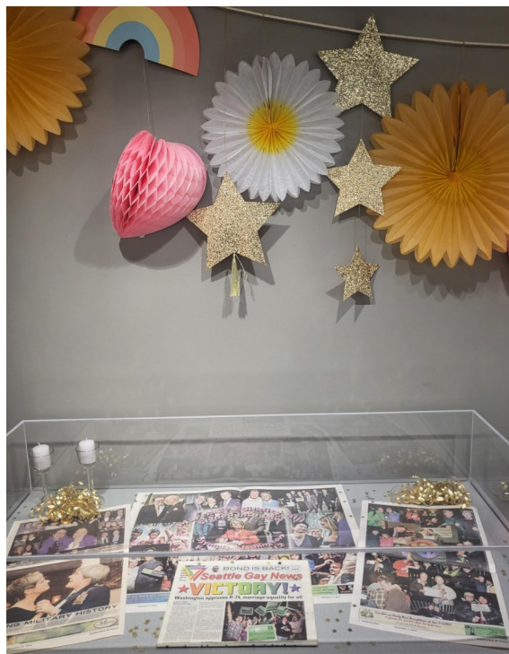
Seattle Gay News exhibit at Seattle Public Library.