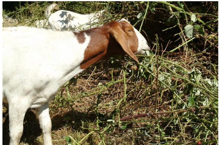
Goats clearing brush in South Park, August 19, 2003. Image 141888 , Record Series 0207-01, SMA.

"Goats to Munch on Invasive Plants at York Park!" was the headline of a 2005 media advisory from the Department of Parks and Recreation. The text went on to explain that the goats' lunch would help clear ground for a new park on the site of a former City Light substation. The park, located between Martin Luther King, Jr. Way and Rainier Avenue, was in an area that the York Park Task Force referred to as "Chubby and Tubby Heights."