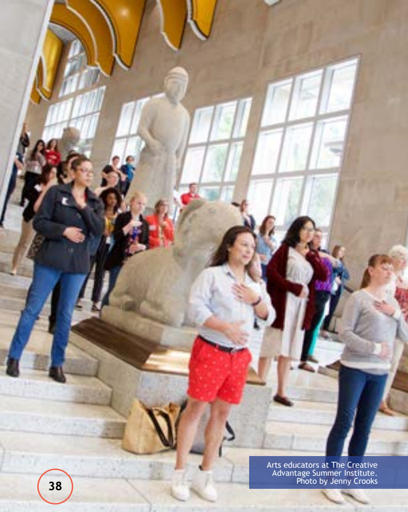
Arts educators at The Creative Advantage Summer Institute.