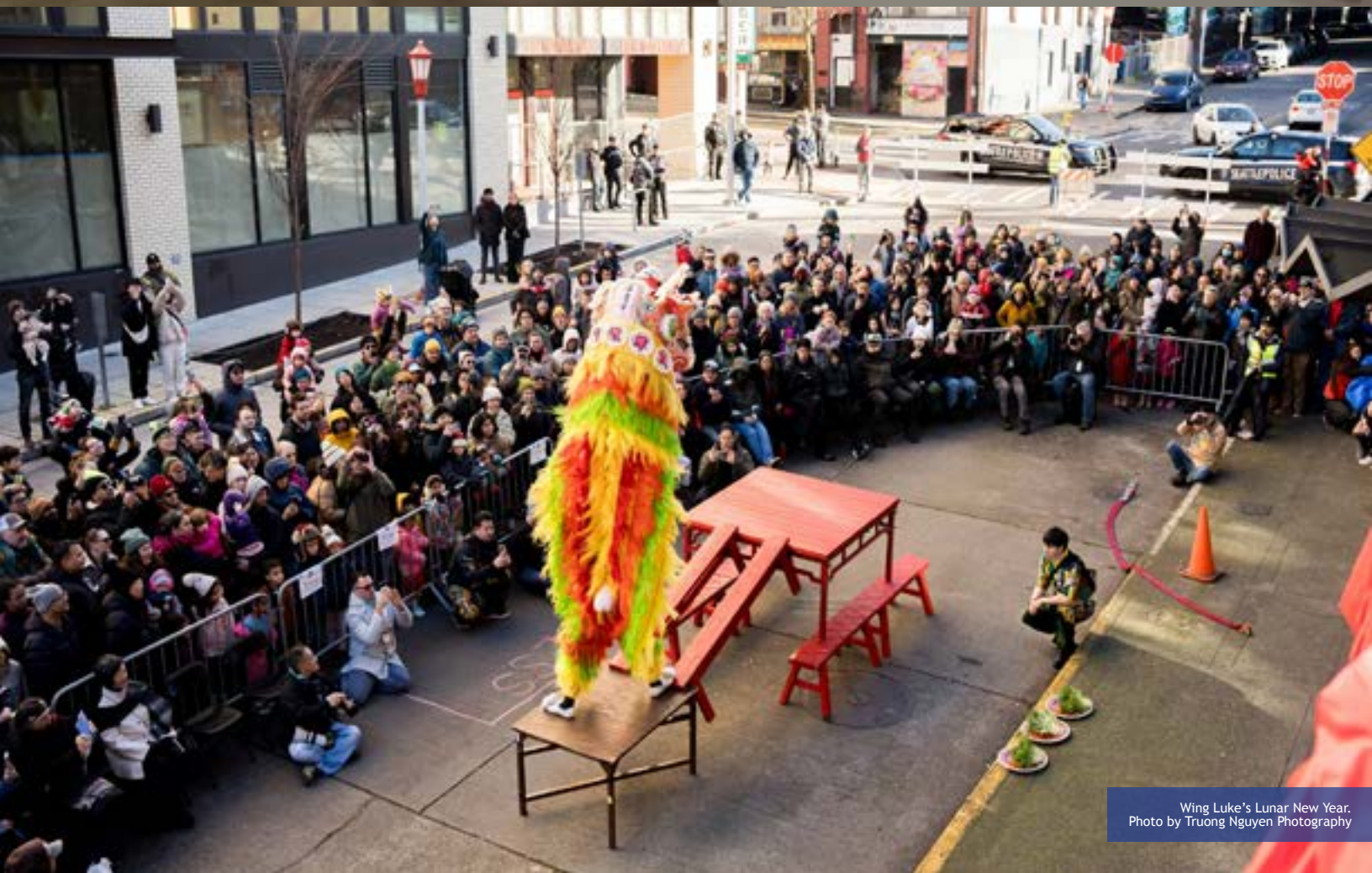
Wing Luke's Lunar New Year.