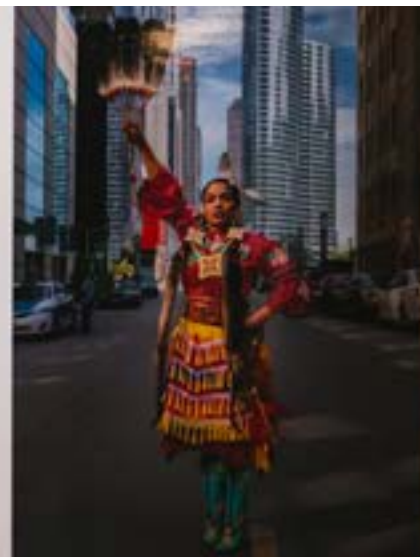
Young visitor at yəhaw' grand opening at ARTS at King Street Station.