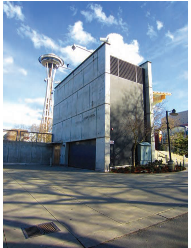
The poles on the wall of the Seattle Center Pavilion