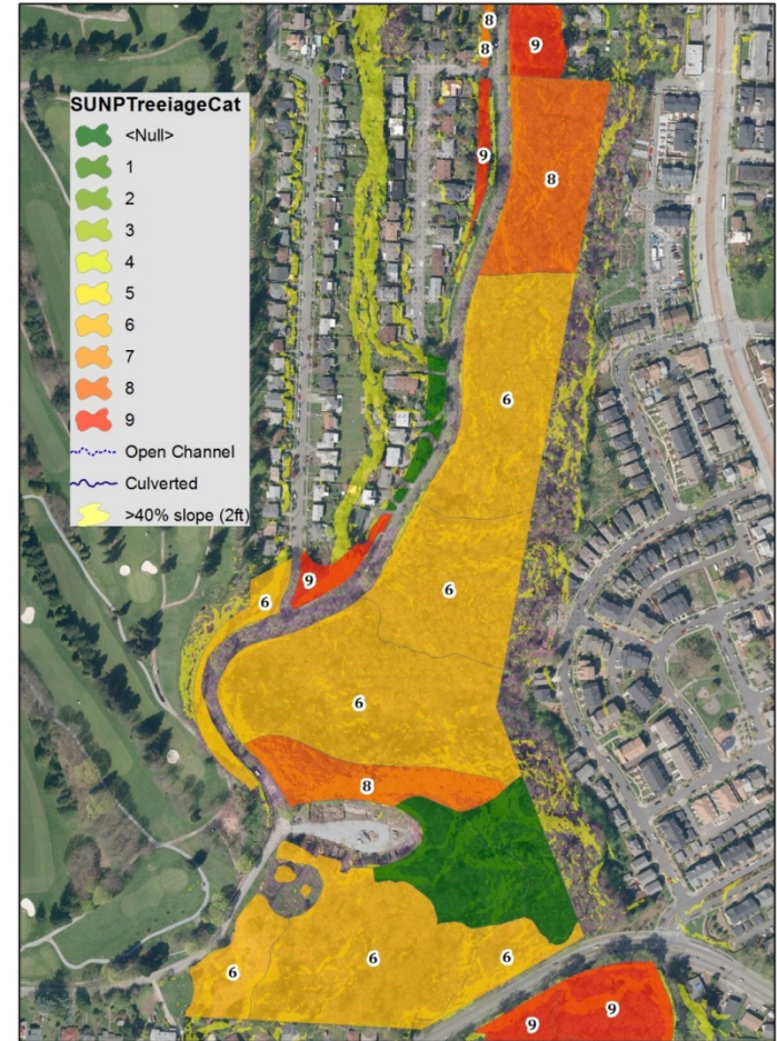
Green Seattle Partnership Restoration Sites