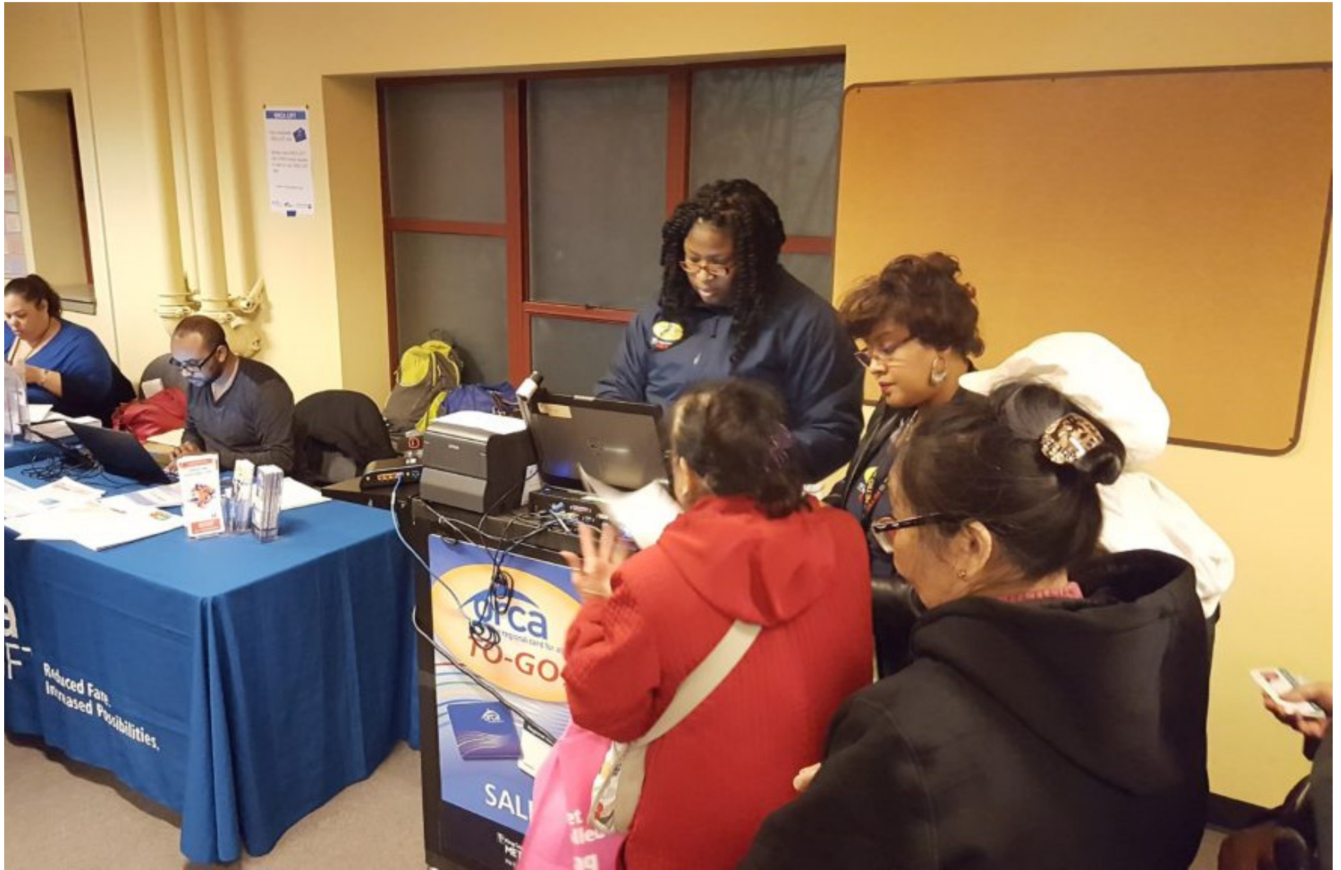
Rainier Vista Mobility Fair, Nov. 2016