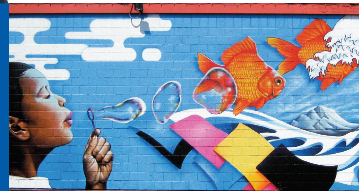
Big Walls by Eras | Seattle, WA