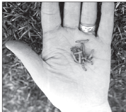
European crane fly larvae

if kept watered and fertilized on a regular schedule. See http://whatcom.wsu.edu/cranefly for a photo guide to monitoring.