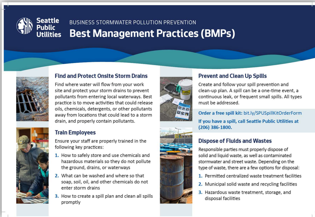
Figure 2: Back page of a new stormwater and stormwater BMP postcard sent to the entire source control business inventory in 2025.